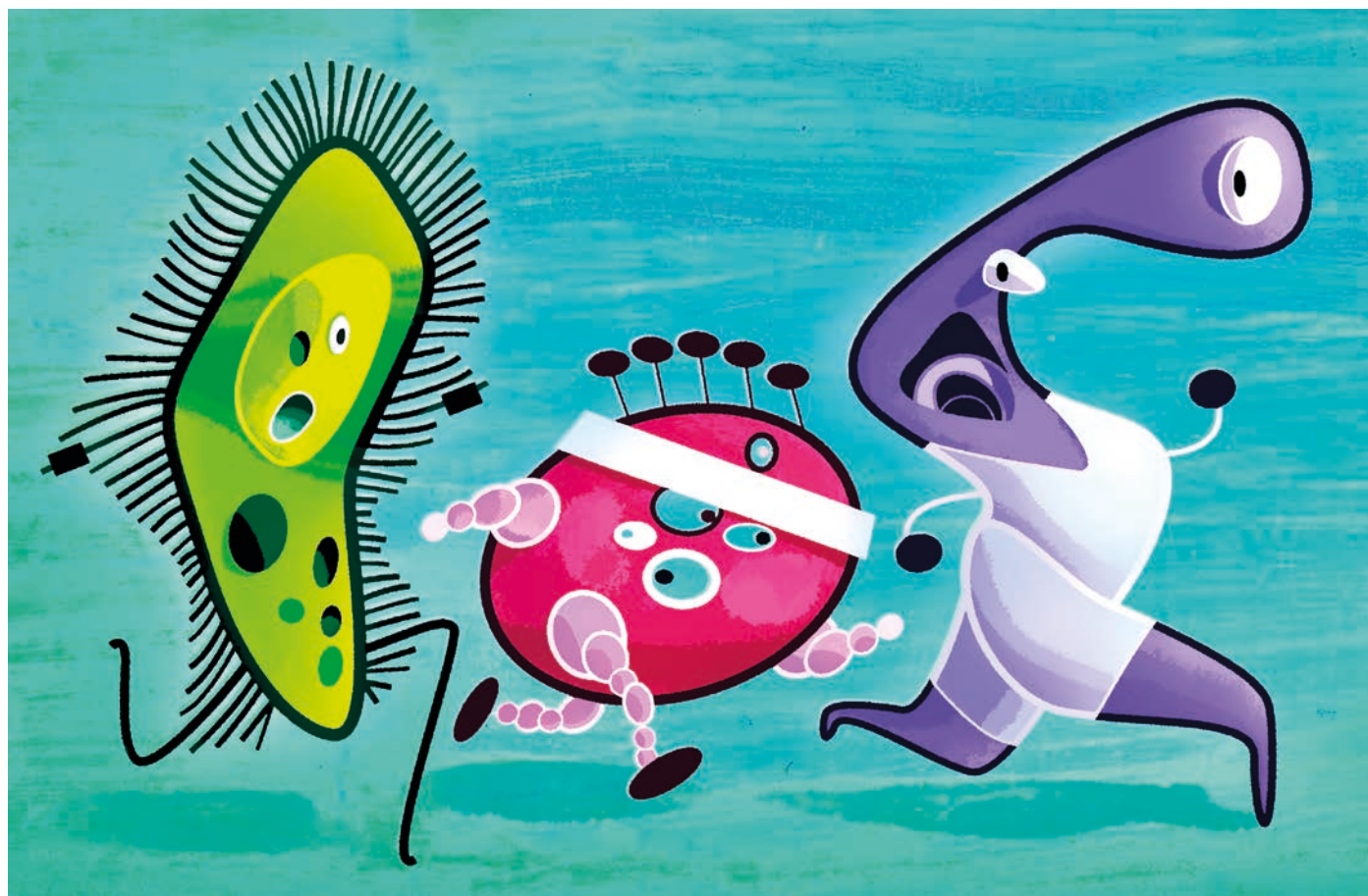
ILLUSTRATION BY JONAS BERGSTRAND